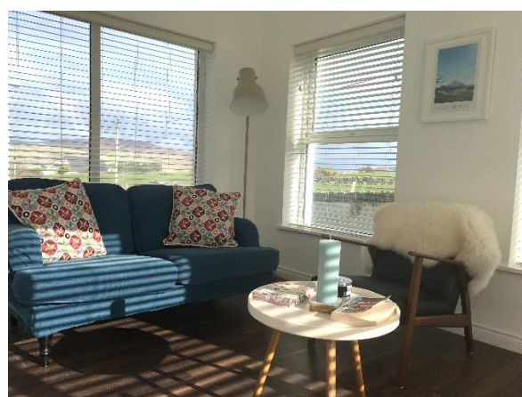
The Sun Room