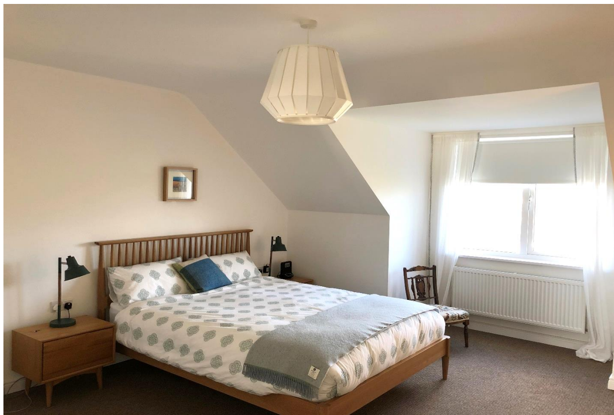
King Ensuite Bedroom