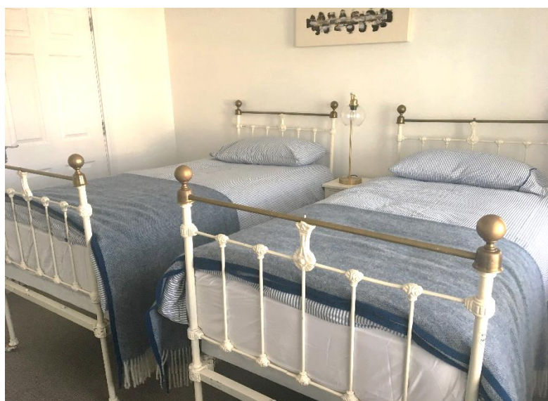
Twin Ensuite Bedroom