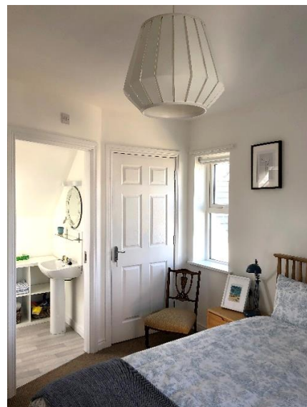
Queen Ensuite Bedroom