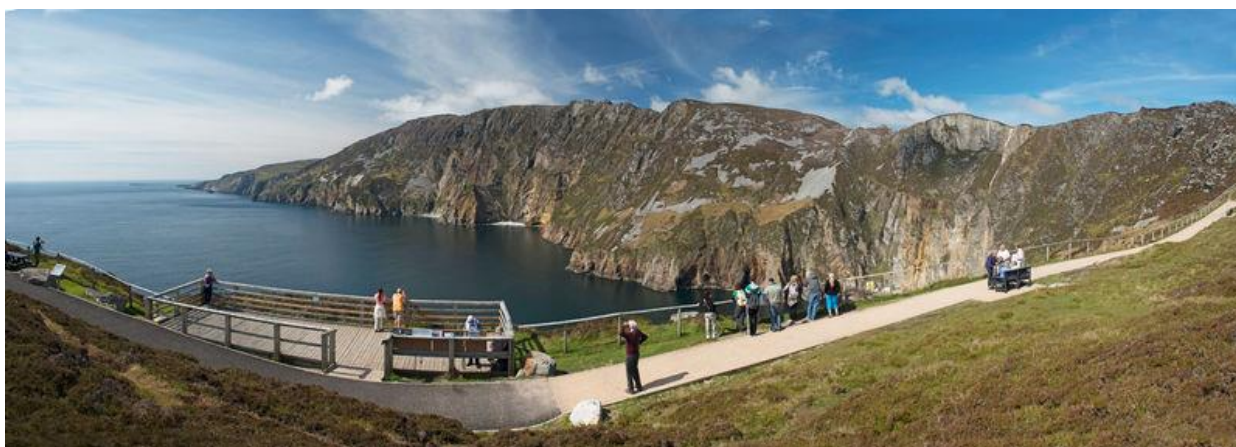
Slieve League Sea Cliffs