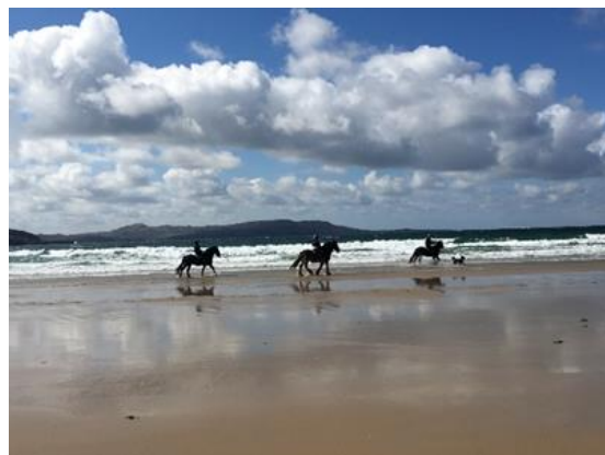
Horse Riding on the Local Beach